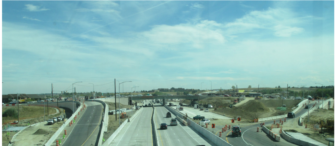
Diverging Diamond Interchange Preparations