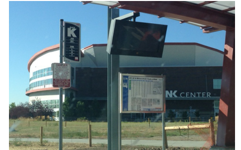
New RTD Bus Rapid Transit (BRT) Stations